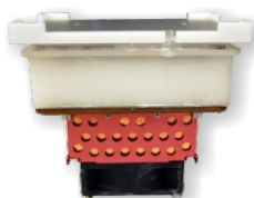
Plate Cooler / Heater Block