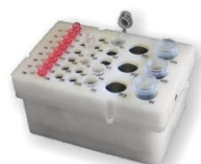
Reagent Cooler / Heater Block