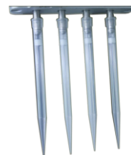
4-Channel Syringe Pipettor