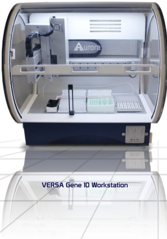
VERSA Gene 10 Workstation